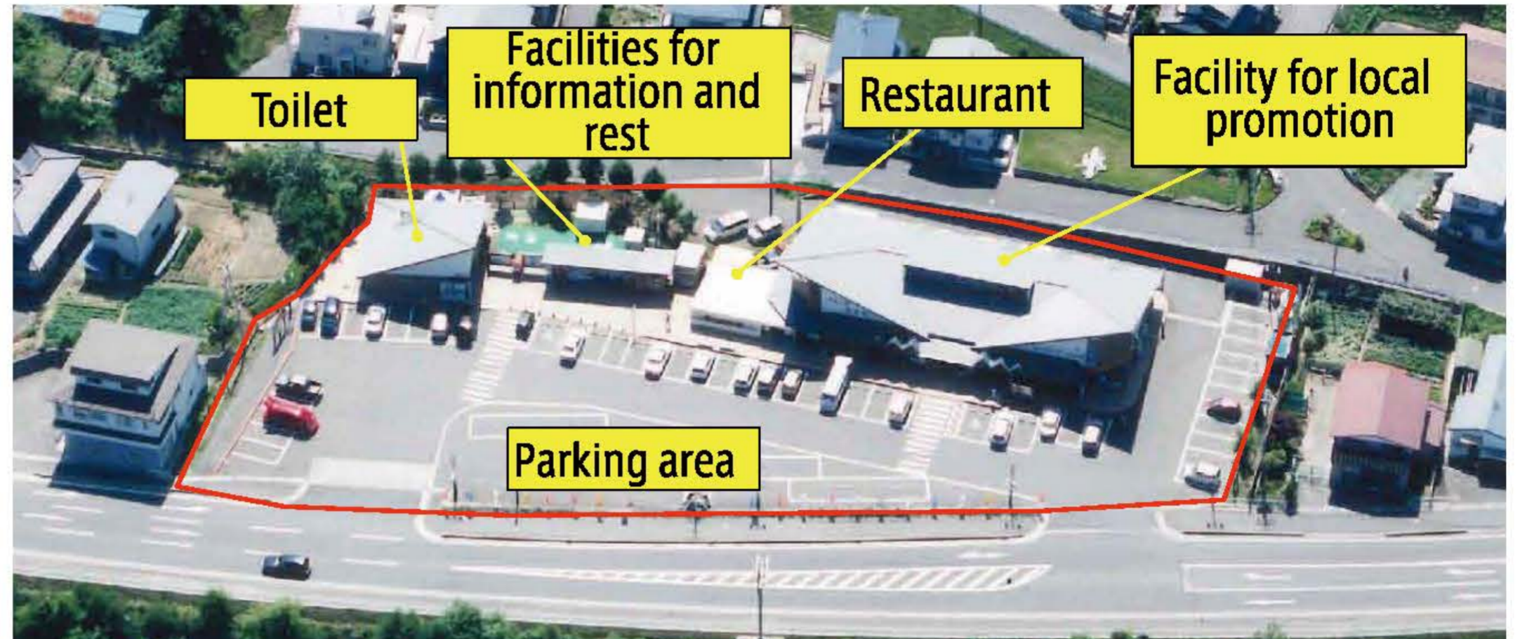
Facilities in "Michi-no-Eki"