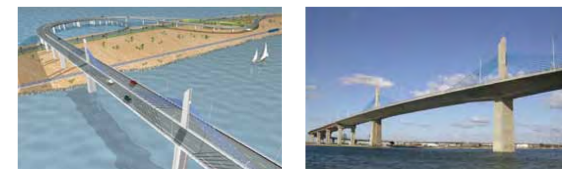
Rades-La Goulette extradosed Bridge with 2.4 km long approach bridges, crossing Tunis lake, Tunisia