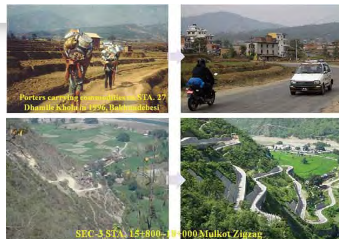
Before and After the Construction of the Sindhuli mountainous Road, Nepal