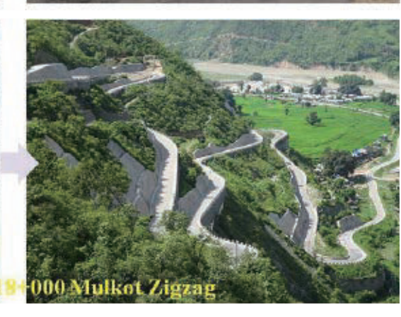
Before and After the Construction of the Sindhuli mountainous Road, Nepal